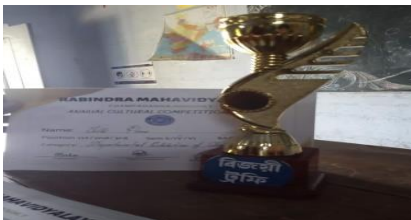
The Department of History participated the Model exhibition in the session of 2021-2022 organised by Cultural sub-committee, RMV. & won the 1 st prize.